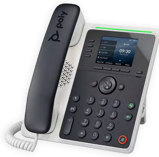
Poly Edge E220