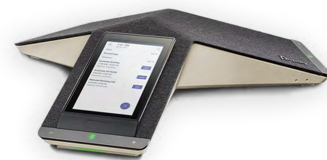
Poly Trio C60