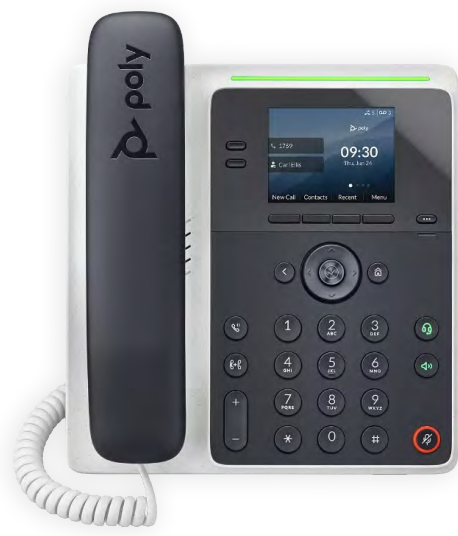
Poly Edge E100