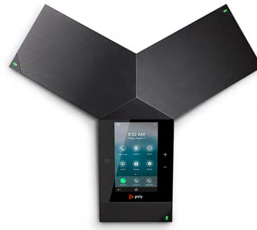
Poly Trio 8300 Conference Phone