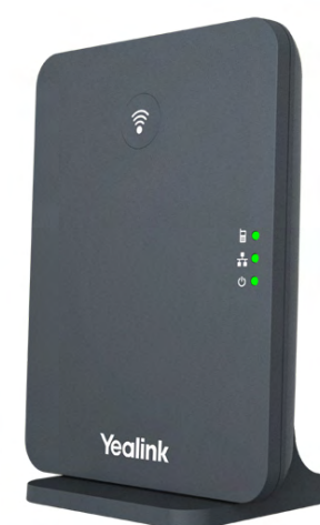
Yealink DECT IP Base Station W70B