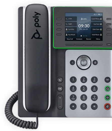
Poly Edge E320