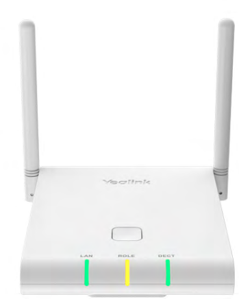
DECT IP Multi-Cell Base Station W90DM