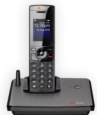
Poly VVX D230