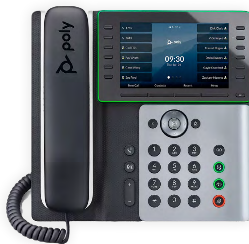
Poly Edge E500