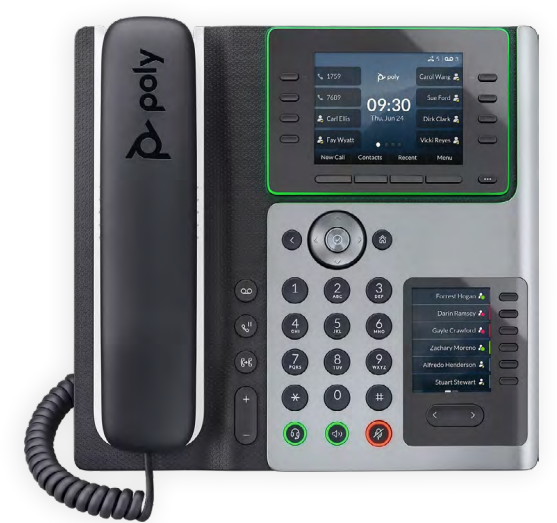
Poly Edge E400