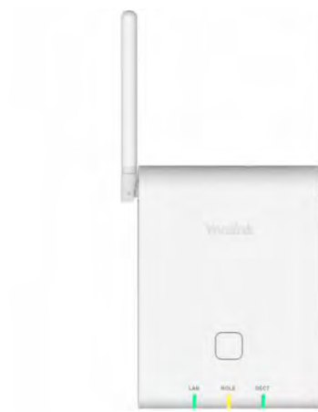
DECT IP Multi-Cell Base Station W90B